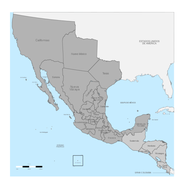
Map of the region of the first Mexican Empire, 1821. Digital Image. Wikipedia. 2020, https://en.wikipedia.org/wiki/Mexican_Texas