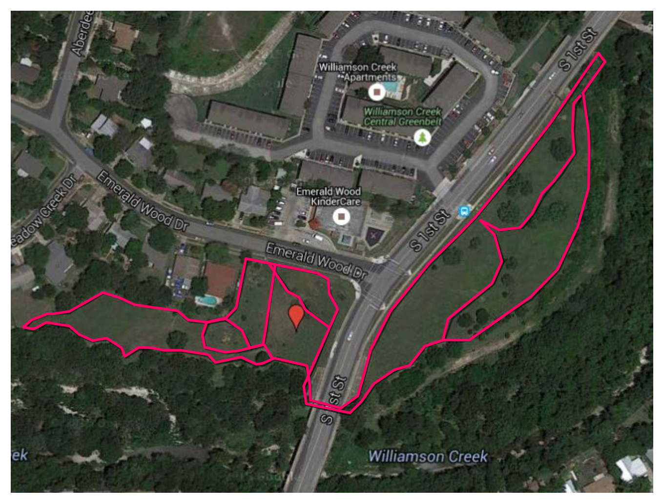
Exhibit of Mulch Trails