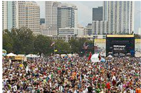
SOUTH BY SOUTHWEST