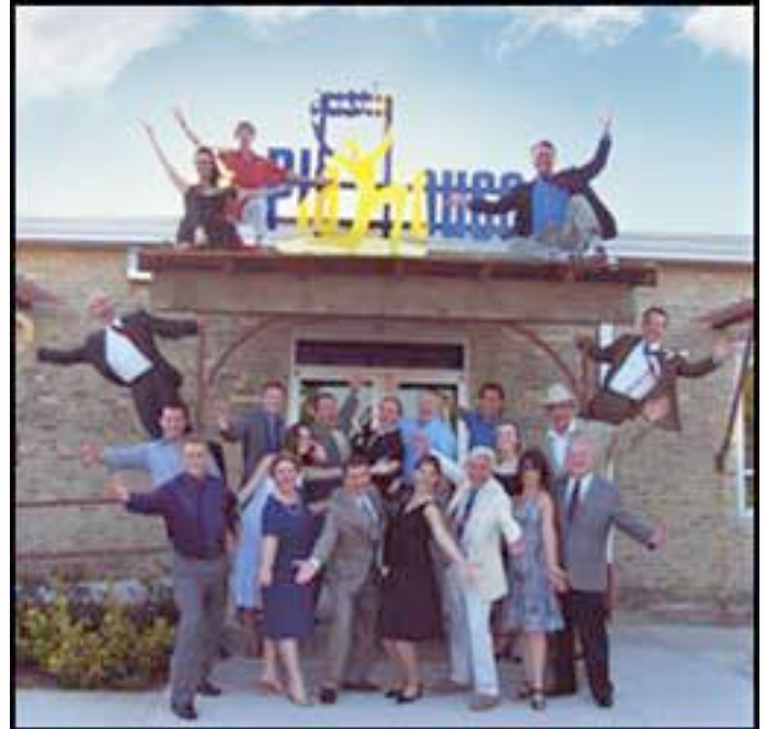
AUSTIN PLAYHOUSE VENUE IN SOUTH AUSTIN

Special thanks go to the core committee assembled by the Austin Playhouse, with help from the City’s Cultural Arts Division, which organized the Artspace visit to Austin, and to the many artists and community members, many of whom attended one or more meetings and testified to the need and desire for live/work, working studio, and arts-centered spaces in Austin.