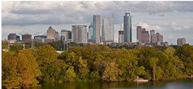
DOWNTOWN AUSTIN AND LADY BIRD LAKE (PART OF THE COLORADO RIVER)

This body of work and the overwhelmingly positive response to a potential Artspace project from all sectors helped set the stage for the feasibility visit. The City’s Cultural Arts Division has been in contact with Artspace for several years, partly as a recommended next step of their “Create Austin” cultural and economic development plan and simply because it made sense.