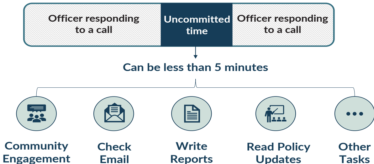
Exhibit 2: Uncommitted time can be less than five minutes and is used for a variety of activities