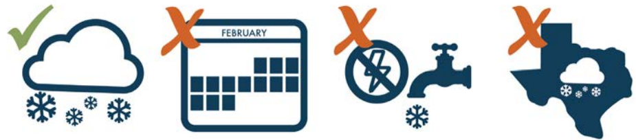
Exhibit 1: City plans recognized a winter storm as a potential disaster but underestimated the storm duration, system-wide loss of power and water, and regional impact