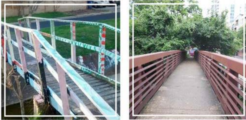
EXHIBIT 2 Pedestrian Bridges Not Included in the Small Bridge Structures Inventory List