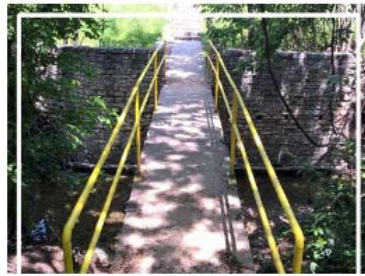
Large Gaps in Handrails