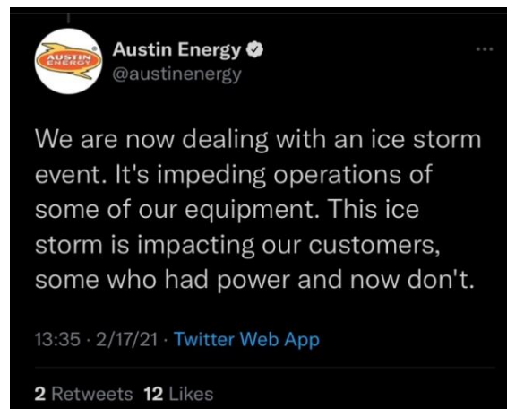
Figure 2: A contemporaneous tweet from Austin Energy which reads, "We are now dealing with an ice storm event. It's impeding operations of some of our equipment. This ice storm is impacting our customers, some who had power and now don't." It received 2 retweets and 12 likes on February 17 th , 2021, at 1:35pm.

The community should be educated about emergency preparedness ahead of time – e.g., insulate pipes, keep emergency supplies, how to shut off water, who to contact or where to go in an emergency.