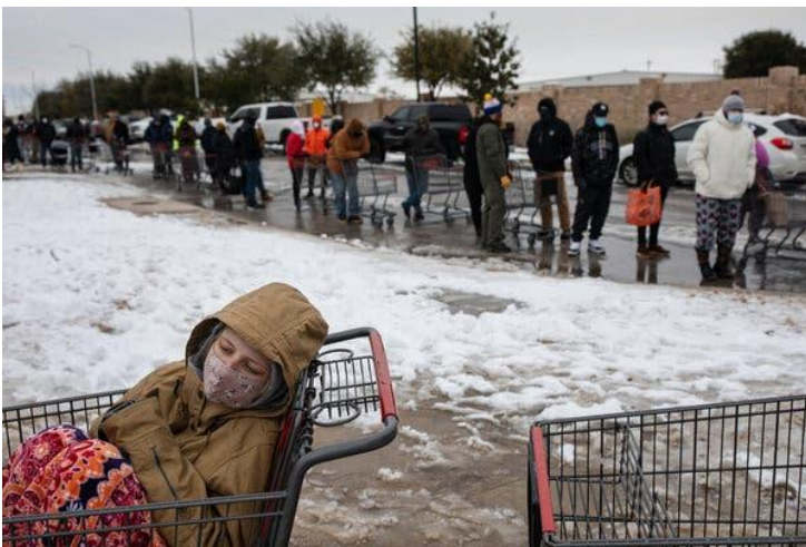
Figure 5: This photo shows someone sleeping in a shopping cart in the foreground of an snowy parking lot, where a line of people in heavy winter clothes stretches off into the distance.

Food provided at some shelters was inadequate, unhealthy or not culturally appropriate, and non-perishable ready-to-eat meals (MRE's) had instructions only in English. Water was provided in plastic bottles, which is not a sustainable, environmentally friendly solution.