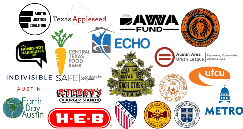
Figure 8: A depiction of the logos for a handful of organizations that lent their support to the community during the storm, including Austin Justice Coalition; Homes Not Handcuffs; Texas Appleseed; DAWA Fund; Central Texas Food Bank; Indivisible Austin; Earth Day Austin, P. Terry's Burger Stand; SAFE Alliance; HEB; LULAC; Austin Mutual Aid; ECHO; Austin Area Urban League; 10,000 Fearless Emergency Response Team; UFCU; CAP Metro; Huston-Tillotson University; St. Edward's University; and The University of Texas at Austin.