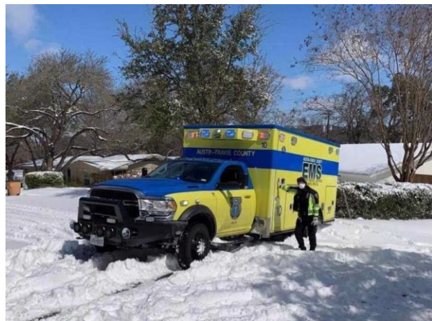
Figure 6: A paramedic leans against an EMS Vehicle trapped in the snow.

There was confusion about who should be making decisions and providing services, since this was a statewide disaster. Was the lack of energy a city or state failure? Where should state or federal authorities provide resources and support?