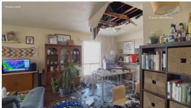
Figure 7: An apartment is completely destroyed by a large hole in the ceiling where ice and water spill out onto a dining room table.

The city needs to address emergency services training and procedures to be able to operate continually and act in emergency weather situations.